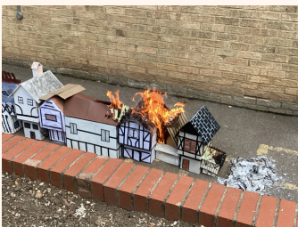
The Great Fire of London