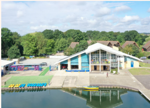
Hertfordshire Young Mariners base