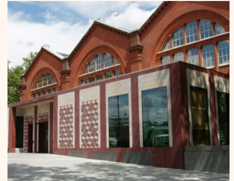
V&A Toy Museum