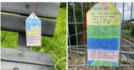
Year 5 Out and About Project