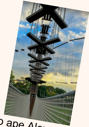
Go ape Alexandra Palace