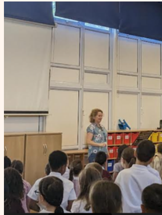
Whole School Music workshop