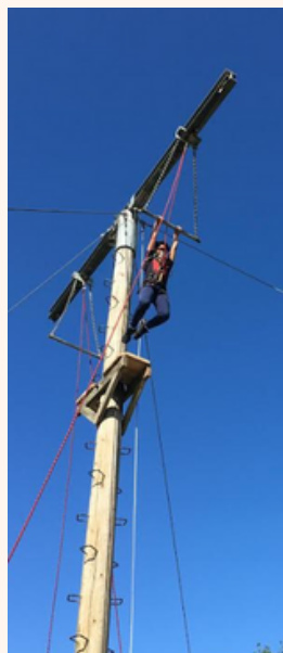
Year 6 PGL